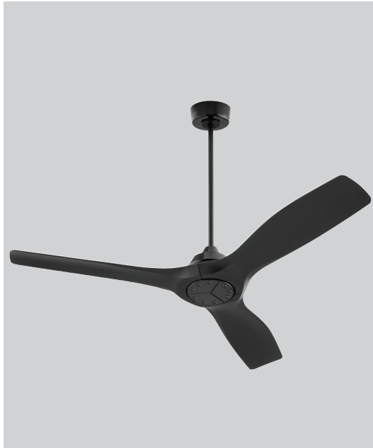
-115 Gloss Black