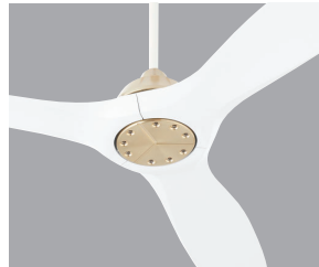
-640 Aged Brass/White