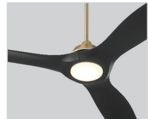
-1540 Aged Brass/Black

SPECIFICATIONS 3 Blades / 52" Blade Sweep / 14.2° Blade-Pitch 4" and 6" downrod (Included) Optional downrods available for high ceilings 6 Speeds - Reversible; 0.400A on high / 0.03A on low 32W on high / 2W on low 170 rpm on high / 47 rpm on low Wall control (Included) Remote control 3-8-2000-0 (Optional)