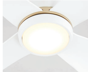
-6 White/Aged brass