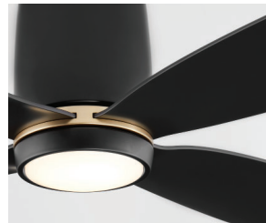
-15 Black - Aged brass

SPECIFICATIONS 4 Blades / 56" Blade Sweep / 13° Blade-Pitch 6 Speeds - Reversible; 0.37A on high / 0.04A on low 30W on high / 3W on low 146 rpm on high / 50 rpm on low Wall control (Included)