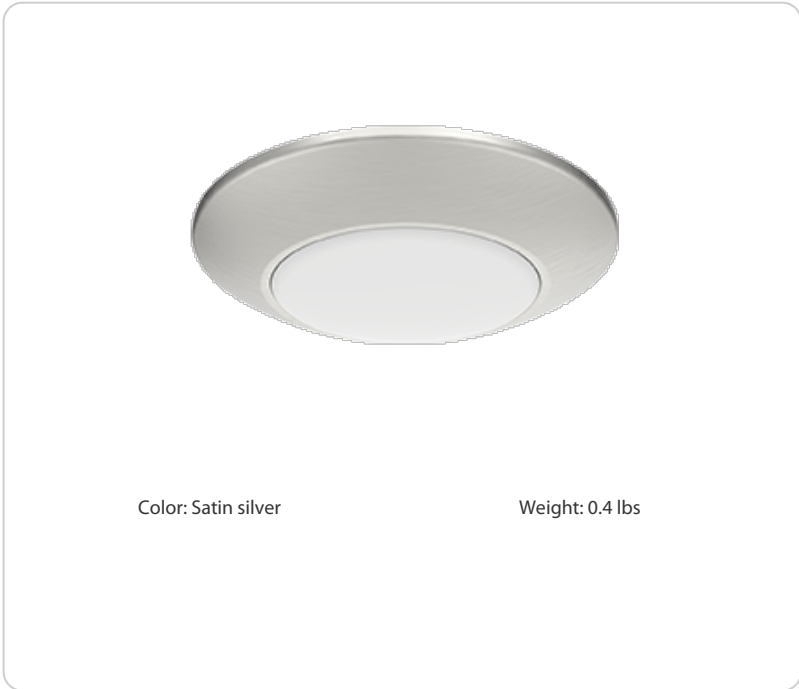
Color: Satin silver