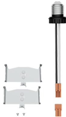
Weight: 0.1 lbs