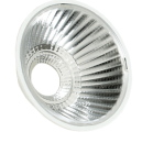
EP735C - EP738C