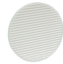
L55 - Double Asymmetric Herculux Lens