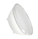
EP739C - 90° Field Changeable Lens