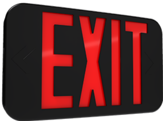
Weight: 1.7 lbs