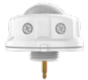
MS-DCE-09-L7 Motion Sensor

Due to continuous product improvements, specification and/or equipment updates may change without notice.