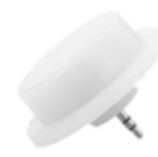
FCB-DCE-02-BT5.0 Bluetooth Controller