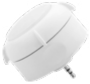
MSB-DCE-06 (Pictured with L7 lens)