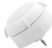
MSB-DCE-06-BT5.0 Bluetooth Motion Sensor with controller