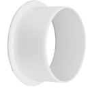
L50W - White Snoot