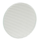
L46 - Linear