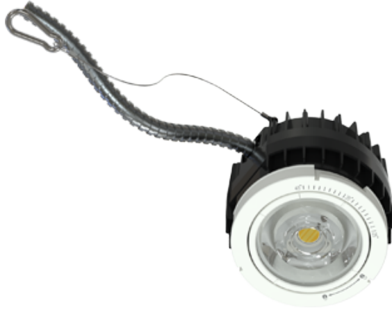
Weight: 2.5 lbs