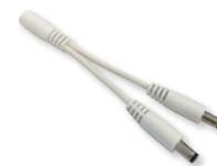
NATL-302W Power Line Splitter