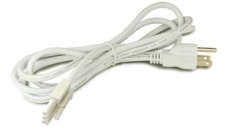
72" Cord & Plug

NUA-804B Black NUA-804W White Used to hardwire NUDTW-88 fixtures to NUA-802 or junction box (by others). Finish: Black or White