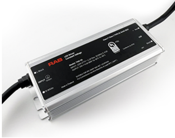
Weight: 1.8 lbs