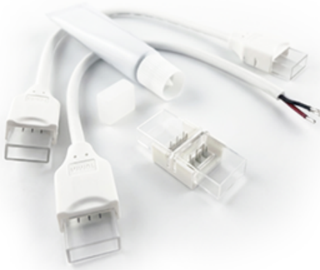
Weight: 0.1 lbs