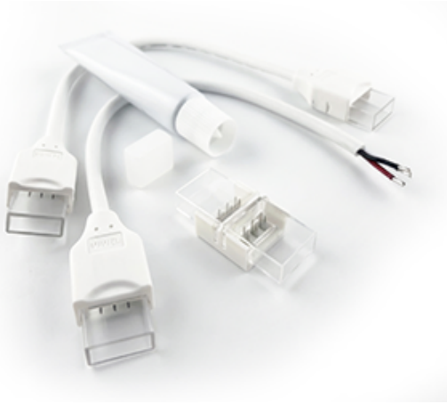
Weight: 0.1 lbs