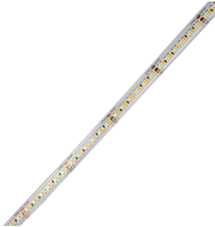
Weight: 0.9 lbs