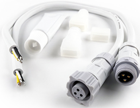
Weight: 0.1 lbs