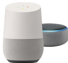
Voice Assistant (Not Included)